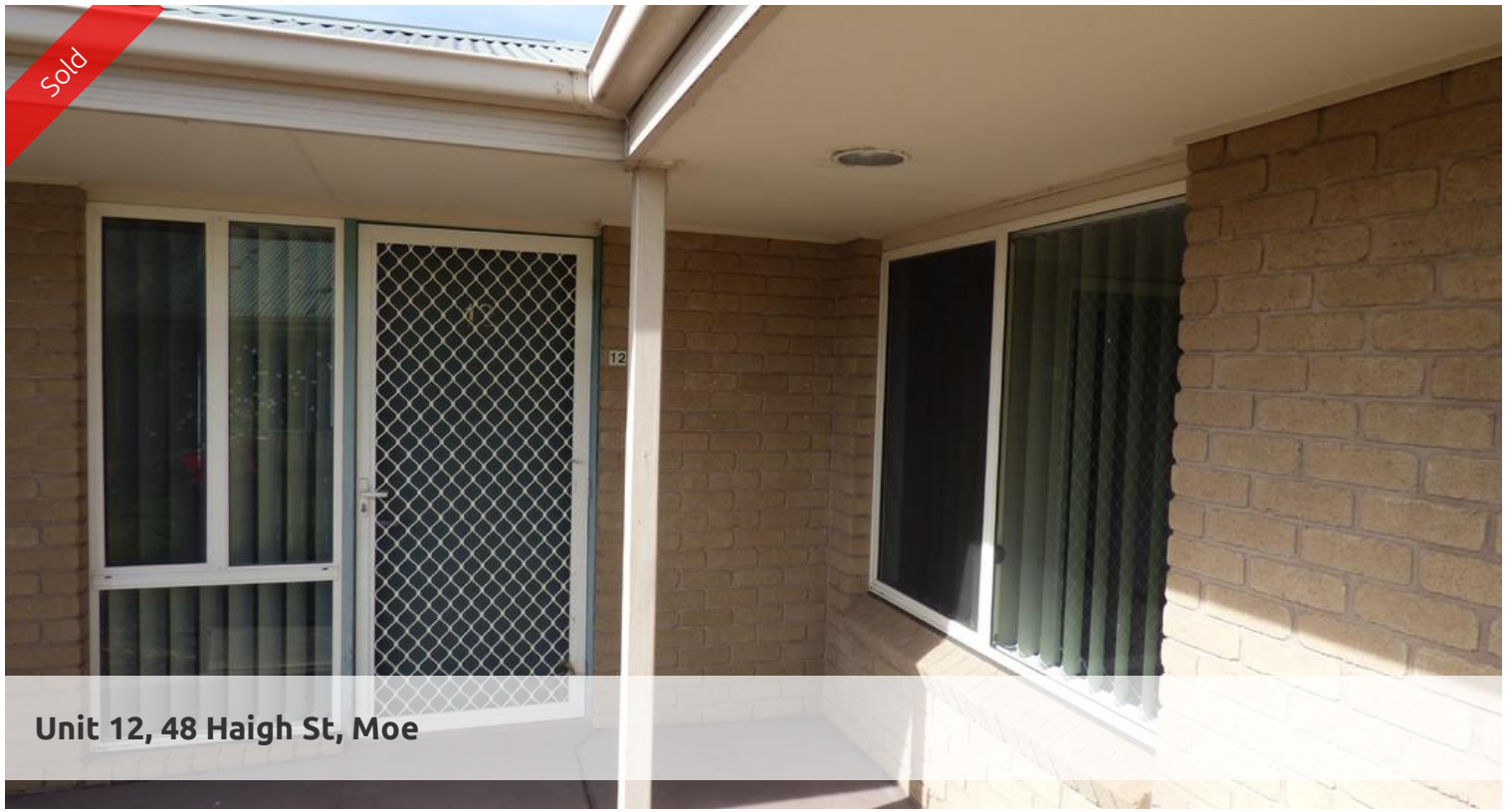
Unit 12, 48 Haigh St, Moe