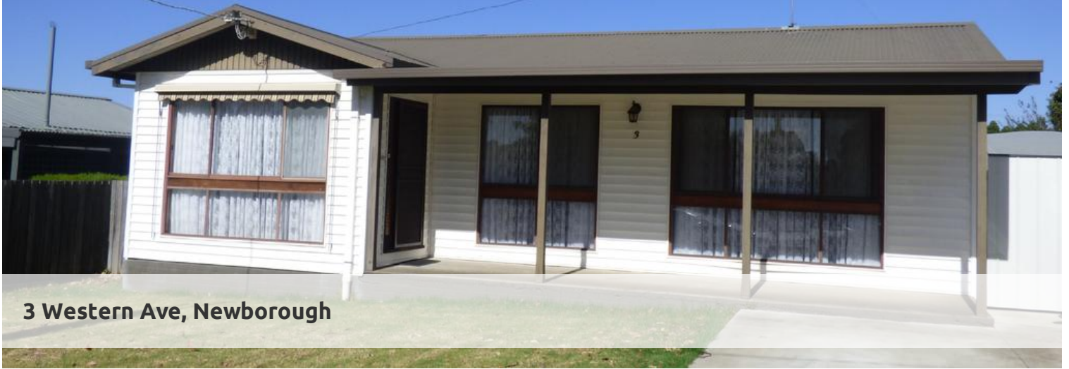
3 Western Ave, Newborough